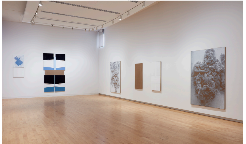
N. Dash (installation view), The Aldrich Contemporary Art Museum; Courtesy of the artist; Casey Kaplan, New York. Photo: Jason Wyche

Dash's work spans painting, sculpture, drawing, and photography, and employs both natural and manmade materials, including pigments, adobe/mud, jute, graphite, fabric, string, styrofoam, and found objects. Across these media, the artist's principal interests lie both in recording the sensory and informational capacities of touch and revealing typically unobserved conduits of energy: ecological, architectural, and corporeal. The works unfold through what Dash terms a "bifocal" approach, where two minds—under the influence of physical and extrasensory influences—are communing visions both nearby and remote.